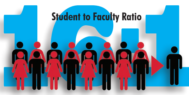
(Many classes are smaller)

Our eSports team has scholarships for team members & &=% competes in the GAC Conference!