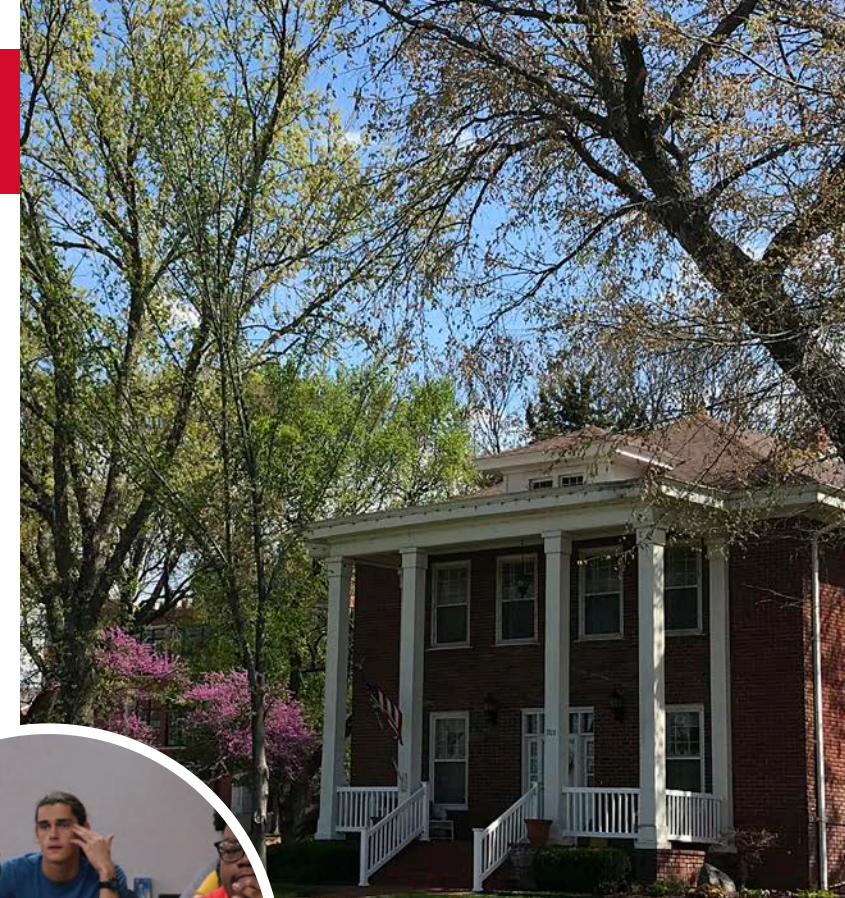
President's Home on NWOSU Campus.