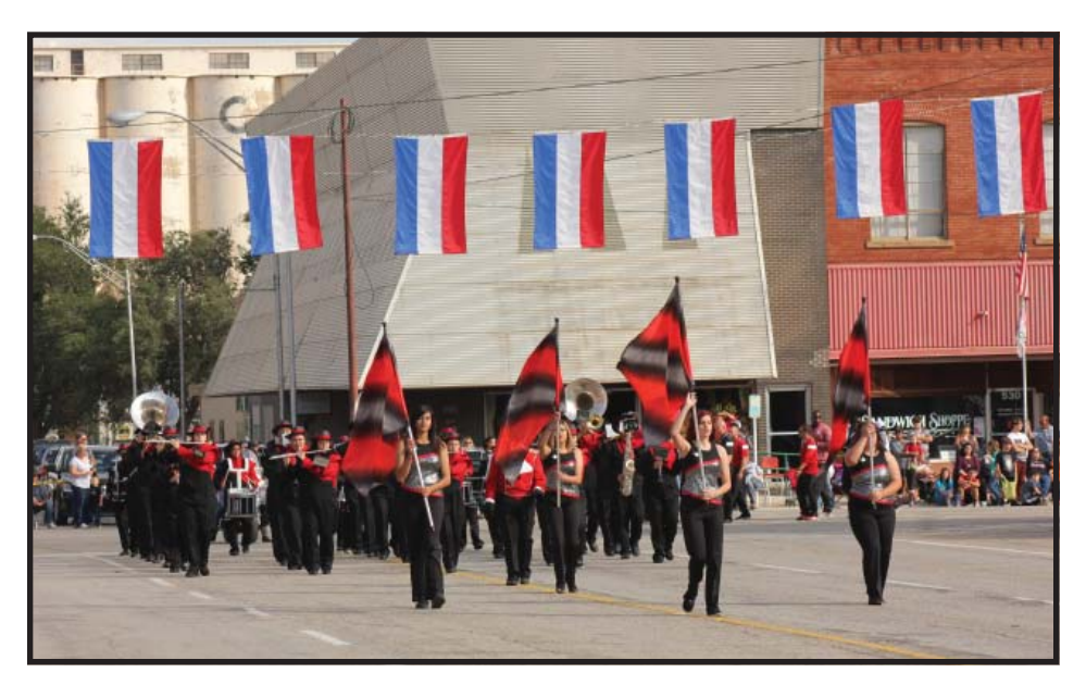
The Ranger band leads the annual Homecoming Parade in downtown Alva. Many area bands were able to participate in this year's parade. The majority of public school student musicians were able to join the Ranger band to kick off the Homecoming football game at Ranger Field.