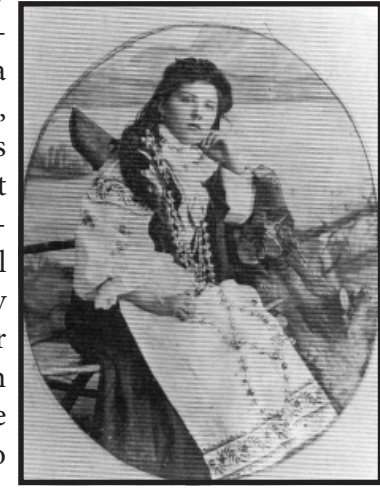
Volga German immigrant Pau-

For more information Schmaltz's upcoming talks contact him at (580) 327-8526 or ejschmaltz@nwosu.edu.