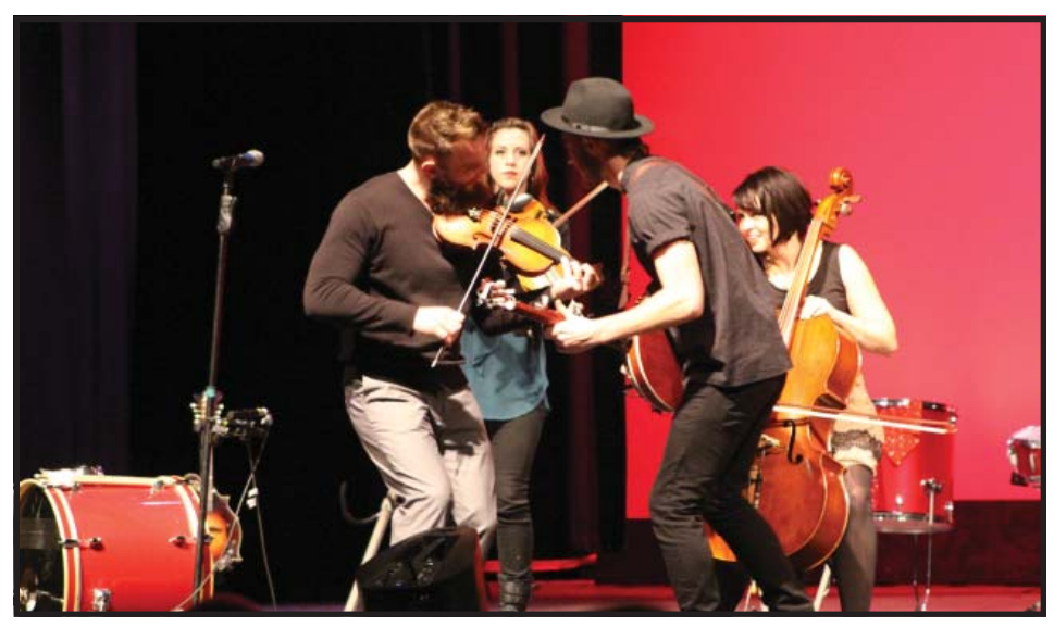
Members of Link Union performing on Northwestern's stage in November as a part of the Northwest Oklahoma Concert Series.

The mission of the Enid Sym-Continued on Page 11