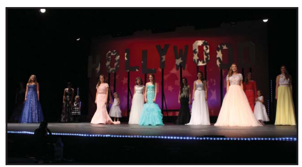
2016 Miss Northwestern contestants on stage during this year's pageant. Lighting and set design were part of the jobs for the Theatre Production classes, technical theatre staff and Castle Players.

Students learned about running lights and audio, plus working as backstage crew members. Others worked as ushers and bouncers.