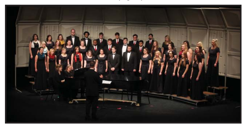
Northwestern Oklahoma State University Chorale