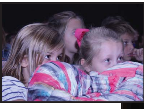
Above: Children in atttendance from area towns reacted to the performance of Bit & Byte.

To learn more about this production or Northwestern's theatre program, contact Weast at (580) 327-8462 or kkweast@nwosu.edu.