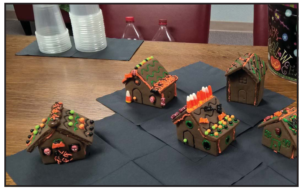
Sigma Tau Delta gathered on Saturday, Oct. 29, for a fun-filled movie night. They viewed the movie Ghostbusters, enjoyed candy and popcorn, and built spooky Halloween cookie houses. Seven Sigma members were present for the event.