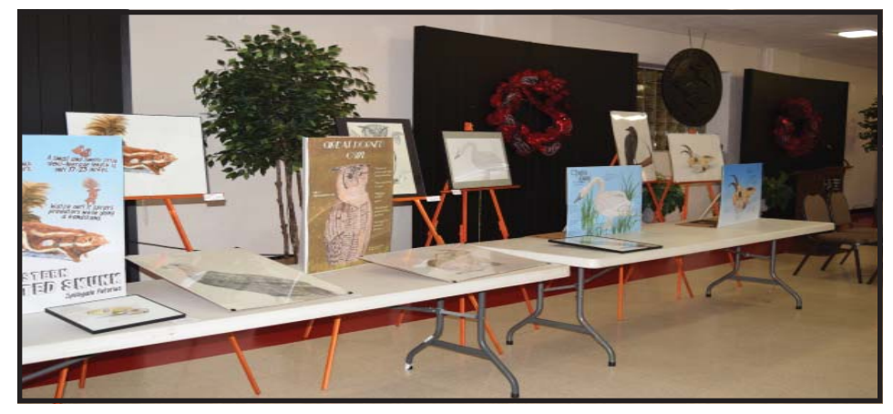
Students in the Visual Art department's Natural History Drawing class participated in the Ranger Research Day competition.

All participants received a certificate of participation, and researchers were encouraged to enter their research projects in the upcoming Oklahoma Research Day that takes place in March 2017 at the Central National Bank Center in Enid.