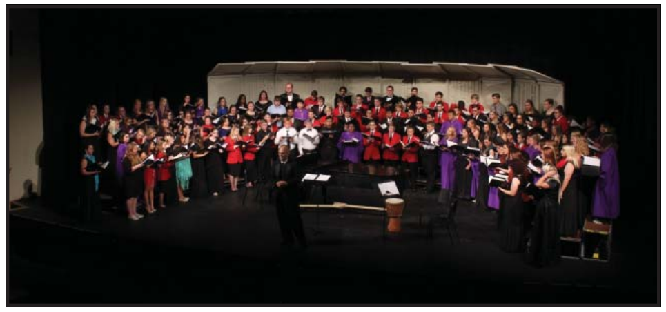
University and high school students joined together for the culminating Holiday Festival Concert after a day of workshops on campus.