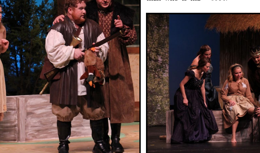
Cast members of Cinderella Waltz Cast members of Cinderella! Cinderella!

Make sure you check out the band adding to the excitement of the games!