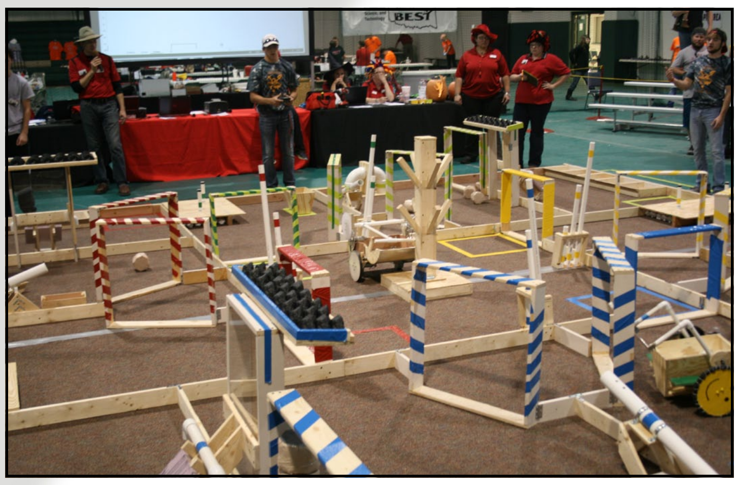
Above: Heartland BEST Gameday! Northwestern employees work with students from around the area at the competition.