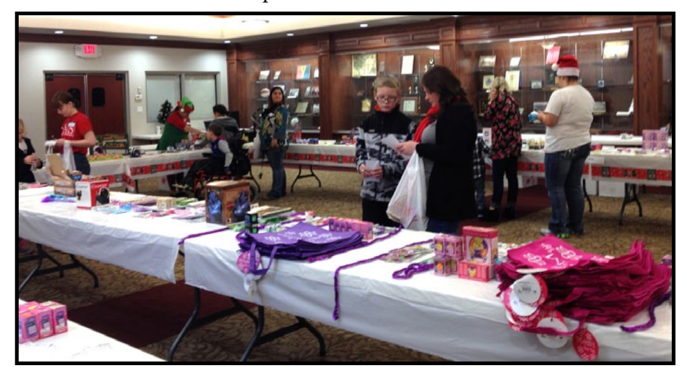
Volunteers help kids shop at the Holiday Store held on Dec. 12.