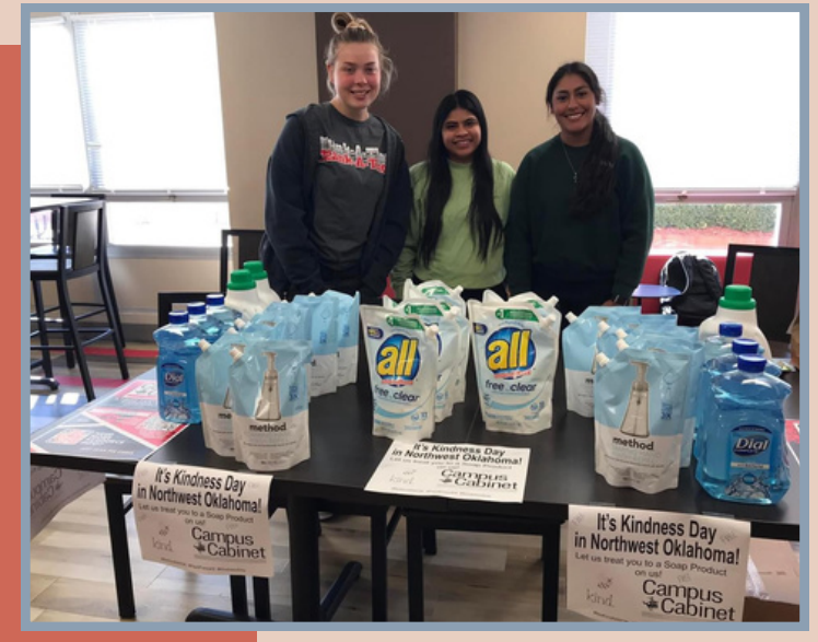
SWAT collected items for the Enid Salvation Army's Food Pantry and delivered it for Kindness Day