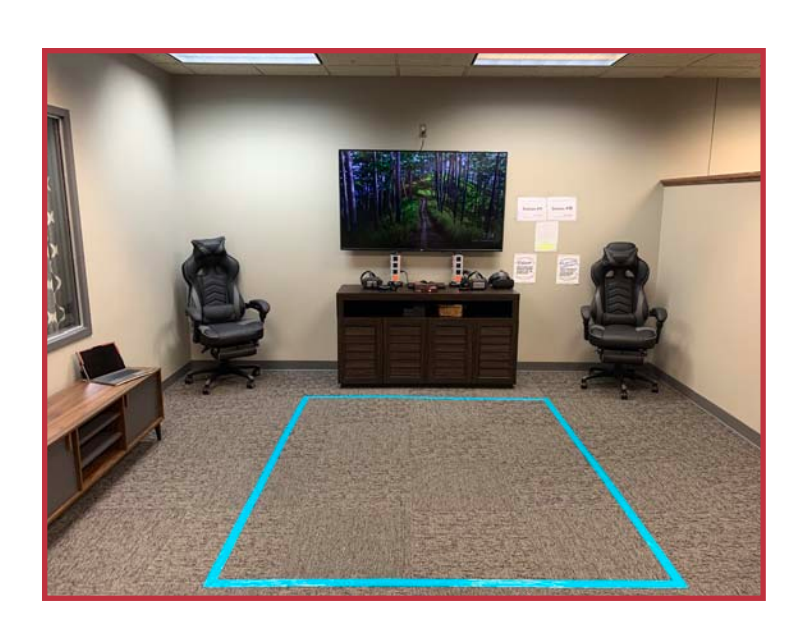
Social Work Virtual Reality Lab

Northwestern Oklahoma State University's Department of Social Work is home to a state-of-the-art Virtual Reality (VR) Lab. This facility features VR headsets and hand controllers that transports students into various virtual environments to learn professional practice skills. This semester, the program has been engaged in program evaluation to assess the impact VR training has on the development of "practice" core competencies. The program looks forward to releasing evaluation data in the Spring. The facility and equipment was funded through the Child Welfare Professional Enhancement Program (CWPEP) Student Payback Funds Grant operated by the University of Oklahoma's Anne and Henry Zarrow School of Social Work.