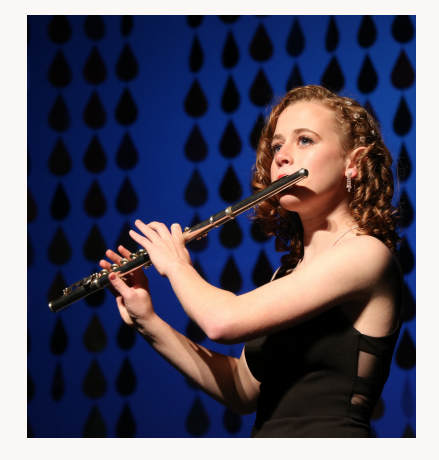
Not sure what to do for your talent or need help practicing your talent? Northwestern's Theatre Program is happy to help! Just mention it to either Co-Director Brintnall or Cline!