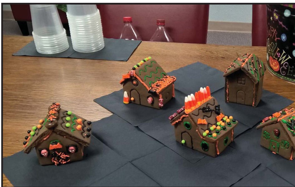
Sigma Tau Delta gathered on Saturday, Oct. 29, for a fun-filled movie night. They viewed the movie Ghostbusters , enjoyed candy and popcorn, and built spooky Halloween cookie houses. Seven Sigma members were present for the event.