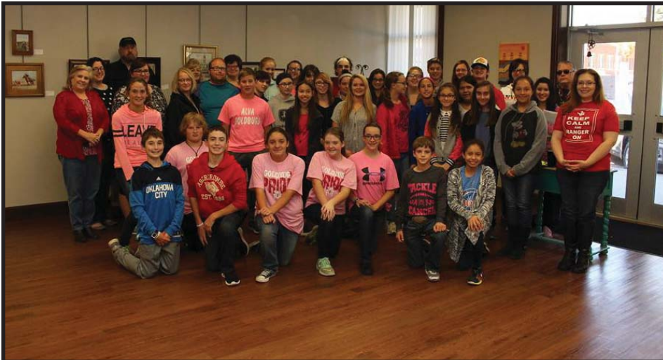
Left: Alva Middle School Writers

She encouraged all to participate, even for a little while. A writing marathon is a writing experience that has to be tried to be fully appreciated.