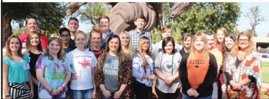
Top: Enid High School participants along with NWOSU Student Teachers.