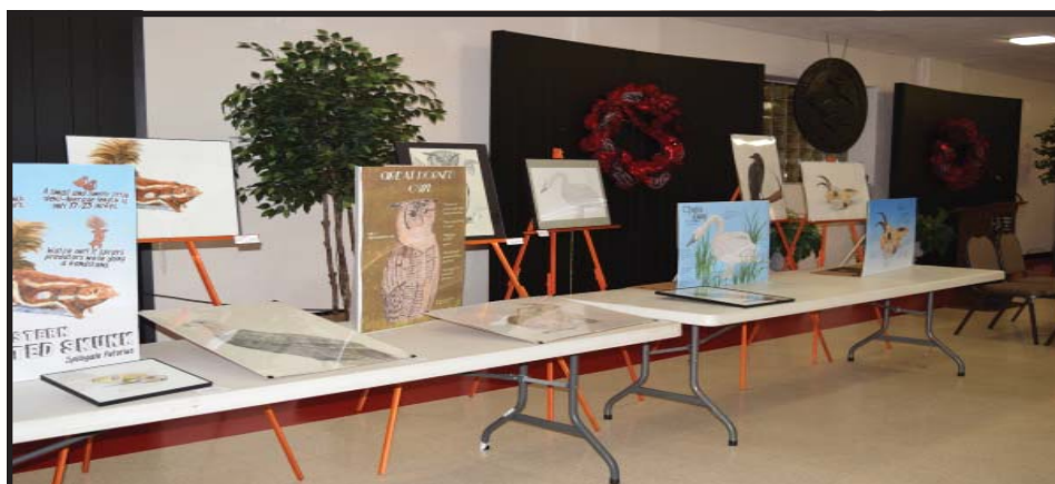
Students in the Visual Art department’s Natural History Drawing class participated in the Ranger Research Day competition.

All participants received a certificate of participation, and researchers were encouraged to enter their research projects in the upcoming Oklahoma Research Day that takes place in March 2017 at the Central National Bank Center in Enid.