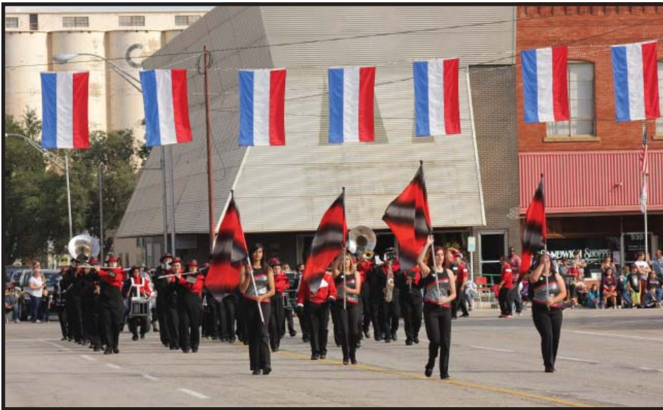
The Ranger band leads the annual Homecoming Parade in downtown Alva. Many area bands were able to participate in this year's parade. The majority of public school student musicians were able to join the Ranger band to kick off the Homecoming football game at Ranger Field.