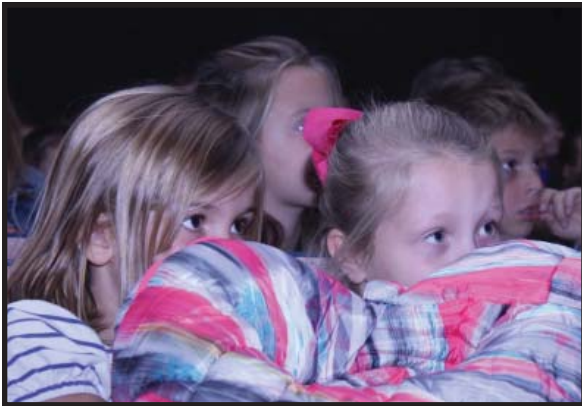
Above: Children in attendance from area towns reacted to the performance of Bit & Byte.

To learn more about this production or Northwestern's theatre program, contact Weast at (580) 327-8462 or kkweast@nwosu.edu .