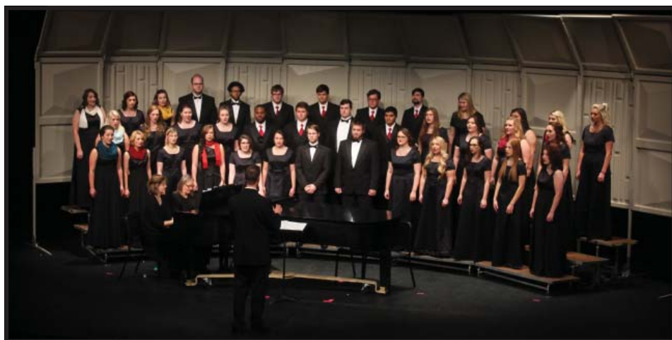
Northwestern Oklahoma State University Chorale