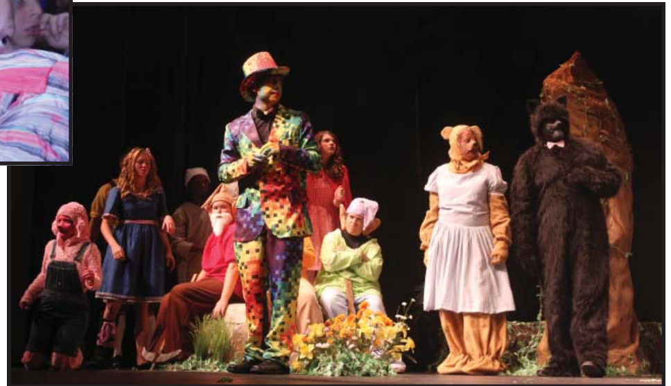
Right: Bit and Byte cast members try to figure out what to do about the Virus that has attacked their world of children's stories, fairy tales and nurse y rhymes.