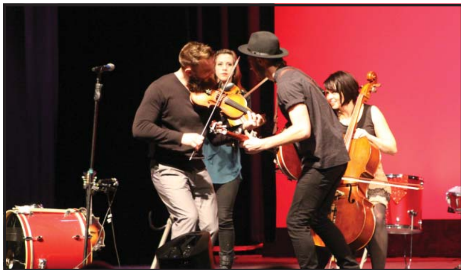
Members of Link Union performing on Northwestern's stage in November as a part of the Northwest Oklahoma Concert Series.