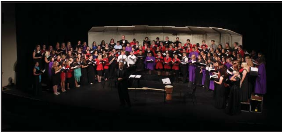
University and high school students joined together for the culminating Holiday Festival Concert after a day of workshops on campus.