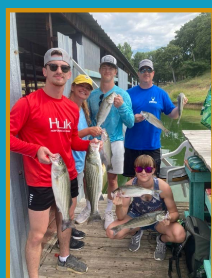
Practicum Site: Kansas Department for Children & Families in Hutchinson, KS